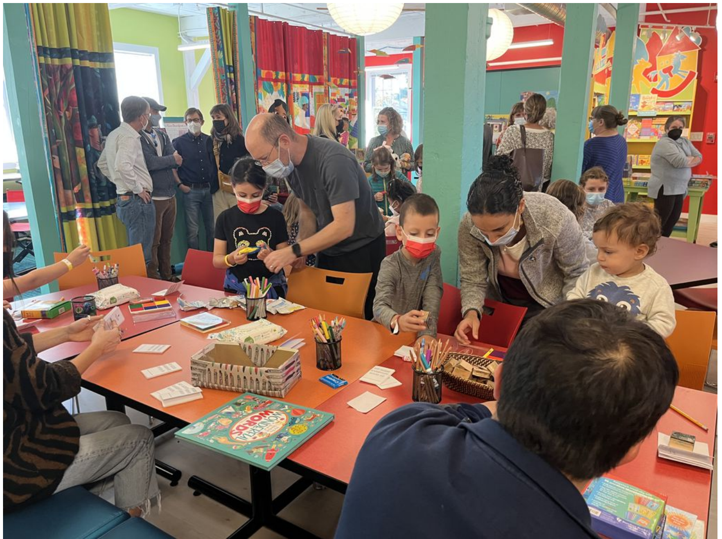
A Barefoot Books community event.

By Kara Baskin Globe Correspondent, Updated September 9, 2022, 1 hour ago