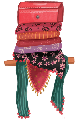
Illustration © Koah Le from Making Happy