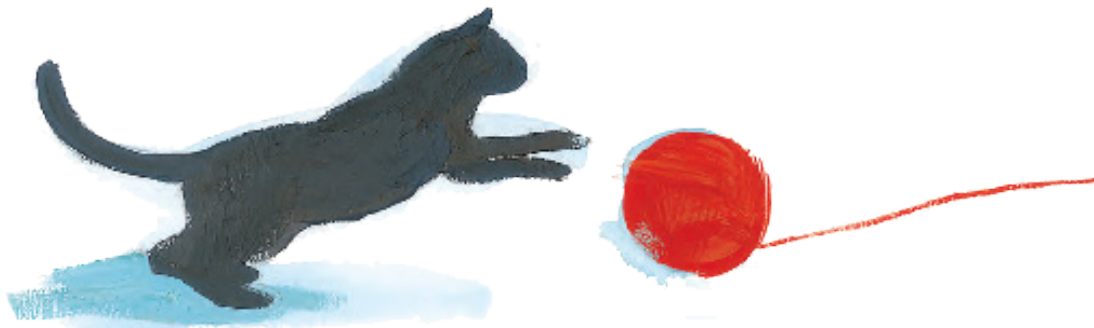
Illustration © Vali Mintzi from The Girl with a Brave Heart