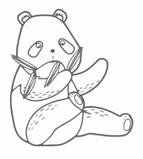
Pandas (Asia) spend about 12 hours a day eating!