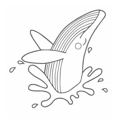
The baleen whale (Antarctica) has no teeth. It uses a combshaped part of its mouth, called a baleen, to trap tiny ocean creatures.