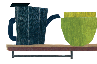
Illustration © Mique Moriuchi from The Perfect Sushi