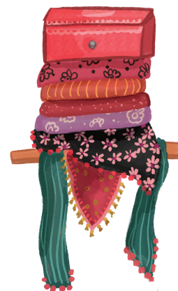
Illustration © Manal Mirza from Hana's Hundreds of Hijabs