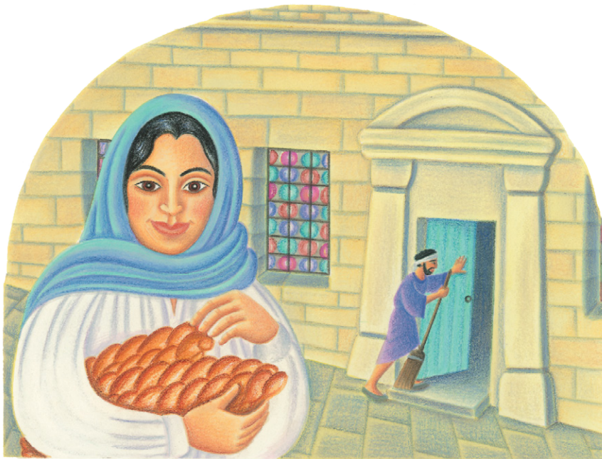
Illustration © Amanda Hall from The Barefoot Book of Jewish Tales