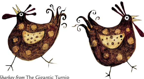
Illustrations © Niamh Sharkey from The Gigantic Turnip