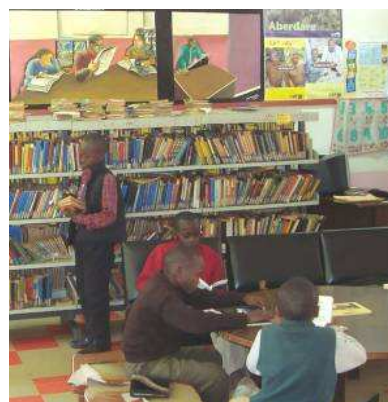
Children's corner, Kenya

The earlier children start to read, the greater the effect on their education and we hope that these projects will encourage families and children to visit their local library and develop a love of reading.